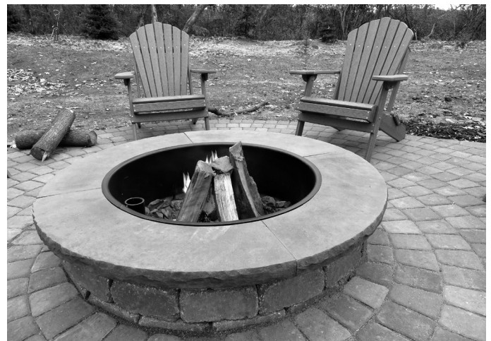
Shown with optional Capstone™ Fire Ring Cap.

NOTE: For additional ideas, download our Project Calculator ( http://www.willowcreekpavingstones.com/paver-project-calculator ) or contact your Willow Creek supplier.