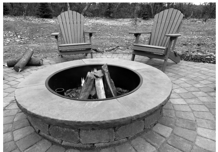
Shown with optional Capstone™ Fire Ring Cap.

NOTE: For additional ideas, download our Project Calculator ( http://www.willowcreekpavingstones.com/resources/paver-project-calculator ) or contact your Willow Creek supplier.